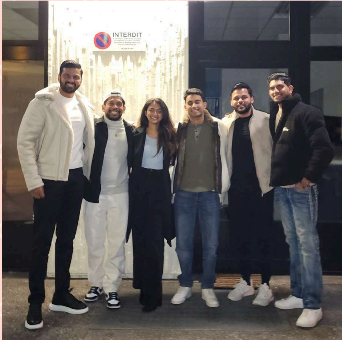
Switzerland Alumni Chapter meet & greet