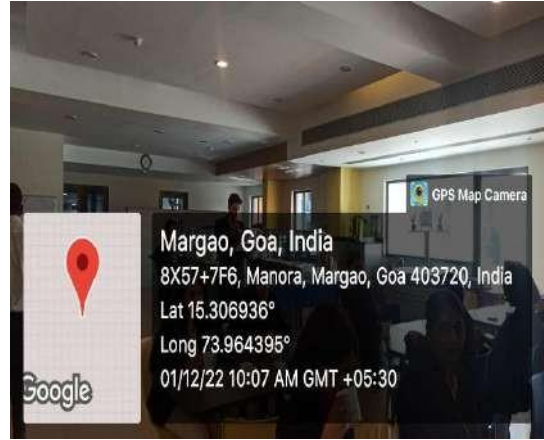
Awareness on Aids through a speech by student: 01/12/2022