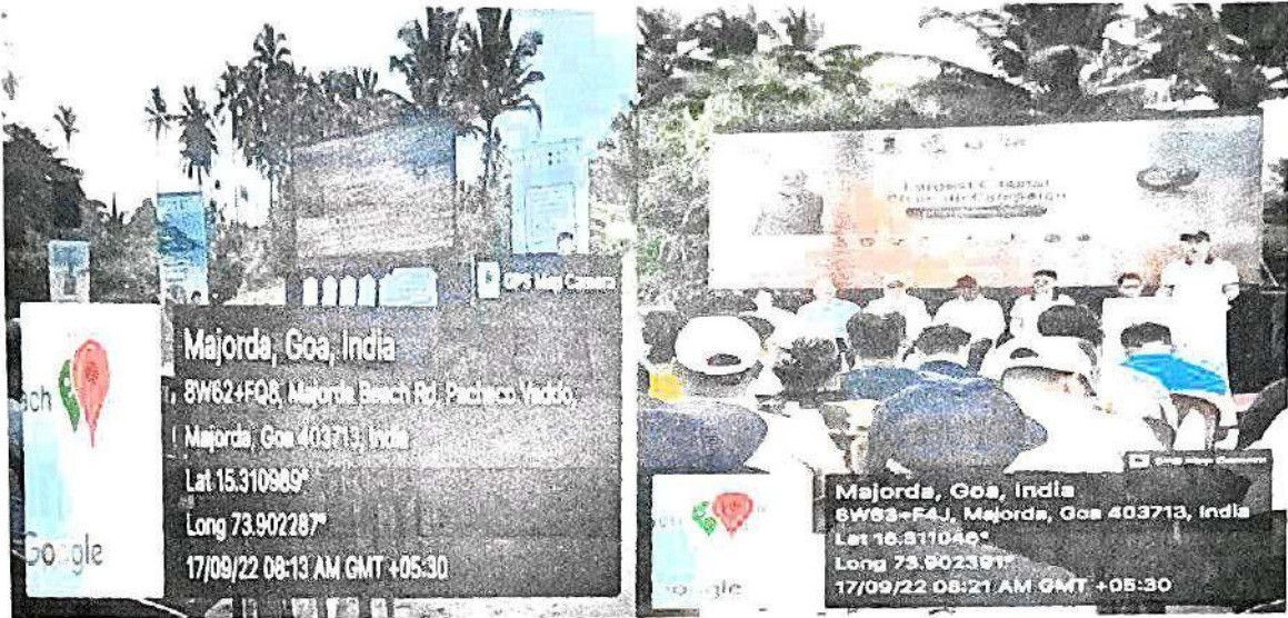
Students of VMSIHE at the Azadi ka Amrit Mahotsav: 17/09/2022