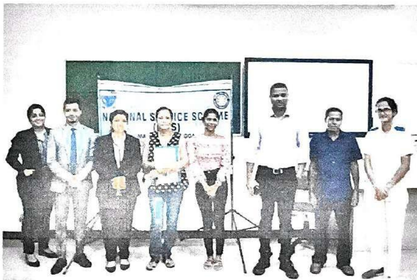
Organizers of the booster dose camp: 04/08/2022

On 04 th August 2022, The NSS Unit of V. M. Salgaocar Institute of International Hospitality Education organised a Booster dose camp. A team of doctors & Nurses from Loutolim PHC conducted the camp from 09:30am to 12:00pm. A total of twenty-Six staff member & 2 students participated in the camp.