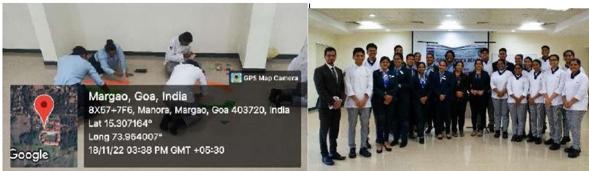
National Integration Day: Rangoli Competition:18/11/2022