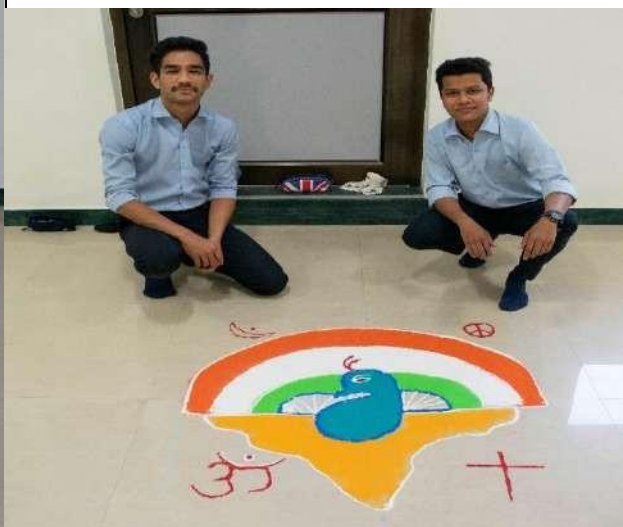
National Integration Day: Rangoli Competition: 18/11/2022