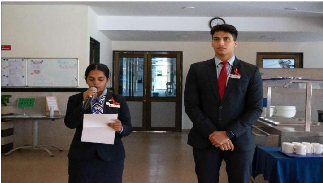
Speech by student spreading awareness on Aids: 01/12/2022