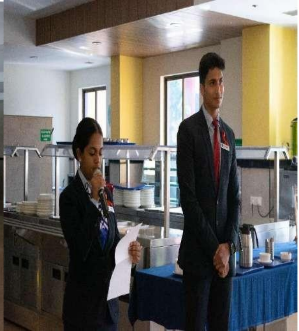
World Aids Day 01/12/2022