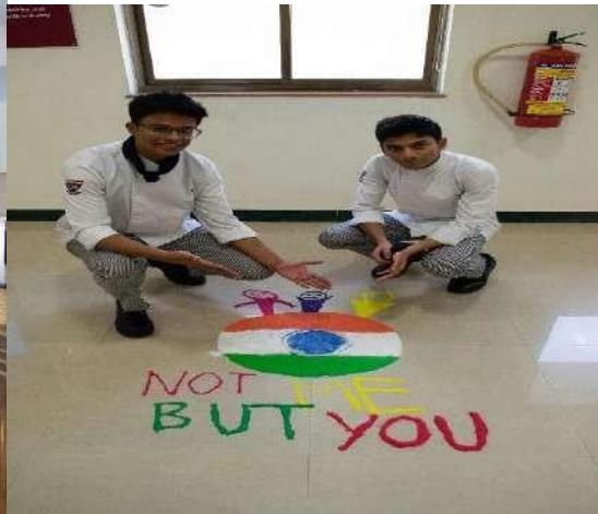
Winners of the Rangoli Competition: 18/11/2022