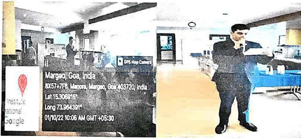
Speech by student on Gandhi jayanti: 01/10/2022