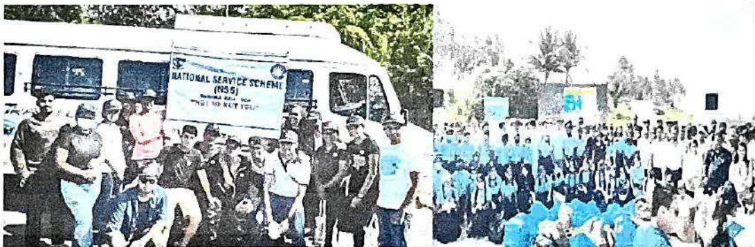
World Coastal Clean up day Fighting for trash free seas: 17/09/2022