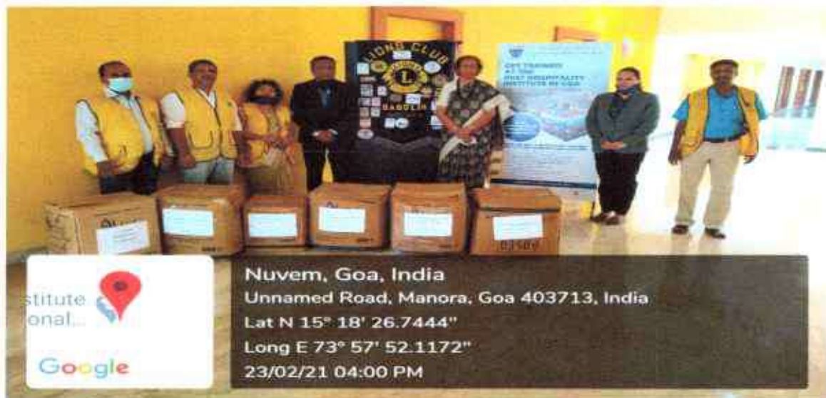
Clothes Donation Drive : 19/02/2021

Staff and students deposited clothes in the collection boxes placed in the campus. Six boxes of clothes were collected.