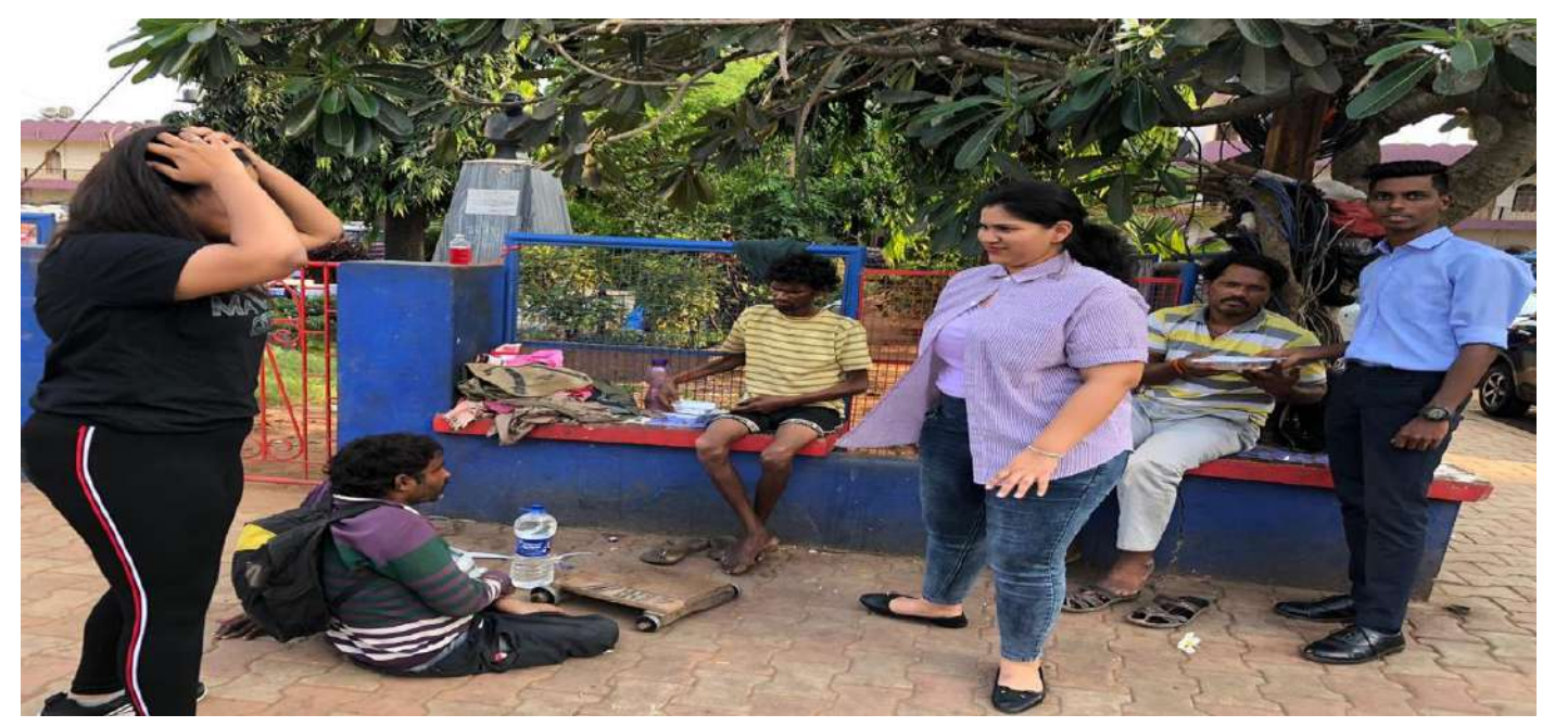
Students donating through the Collection Drive for Homeless People of Vasco : 04/12/2019