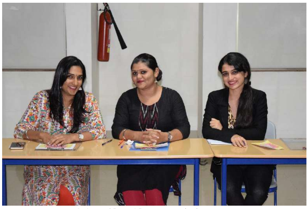
Judges of Barazi Runway : 09/08/2019