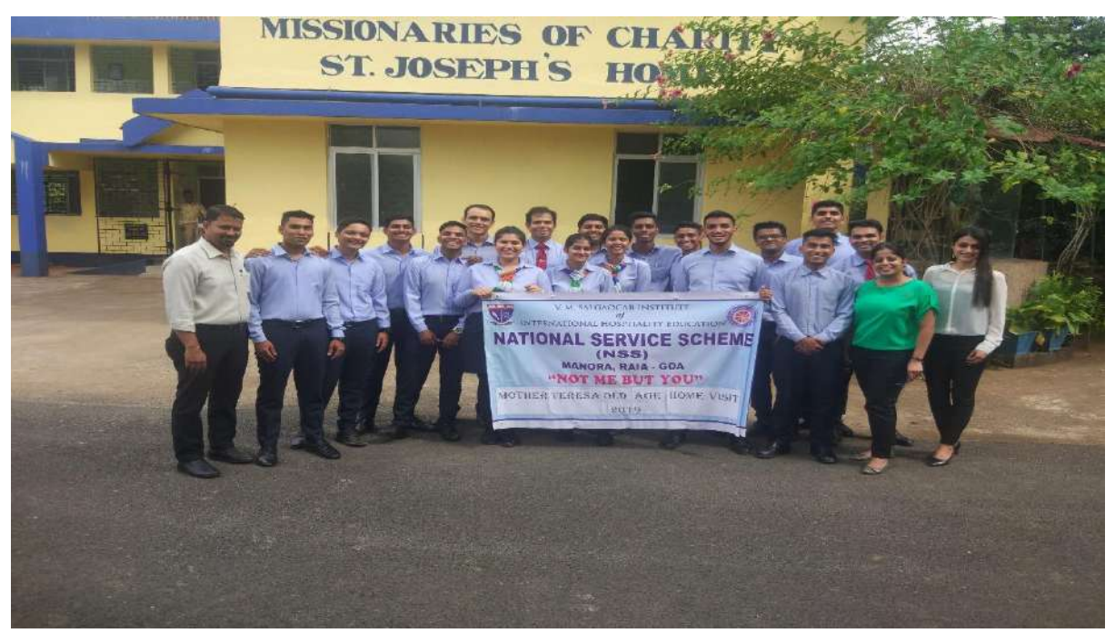
Visit to St Joseph's Home for the Aged: 20/12/2019