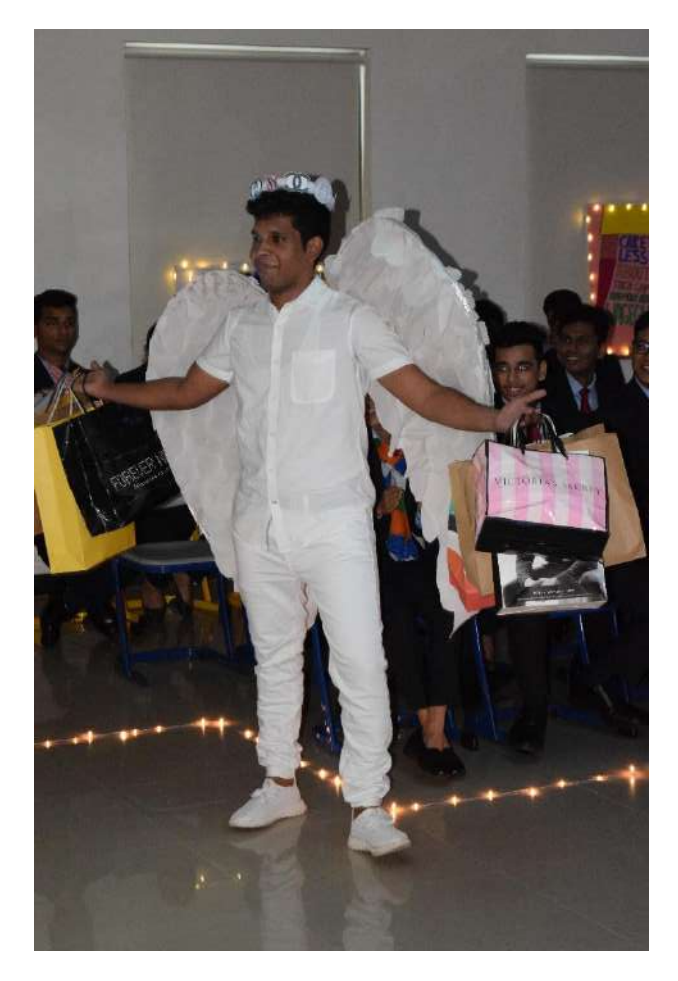
Participant of the Barazi Runway: 09/08/2019