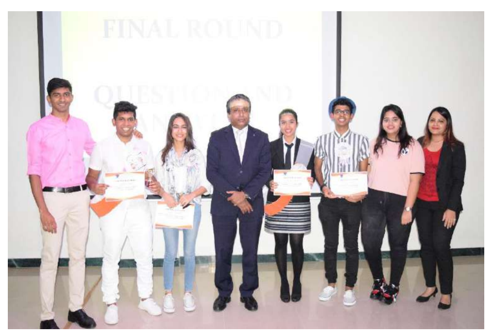
Winners of the Barazi Runway : 09/08/2019