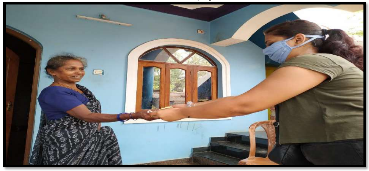
Mask Donation Campaign: 15/05/2020