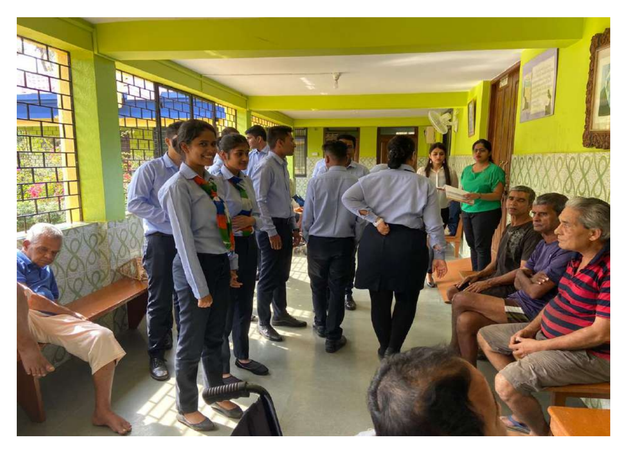
Visit to St Joseph's Home for the Aged: 20/12/2019

The NSS unit of VMSIIHE organised a visit to St. Joseph's Home for the aged on Friday, 20<sup>th</sup> December 2019. The students accompanied by 3 NSS officers interacted with the elderly and organised a few games and spot prizes for them. The students also sang carols and encouraged them to sing songs too. Donations in the form of used clothes, shoes, bags, bed sheets, towels etc. was collected prior to the visit in the college and donated to the Mother Teresa Missionaries for Charity Foundation. It was a touching experience for the students as they learnt that many of the residents were destitute, differently abled or abandoned. They left with many memories and most of them promised to go back to visit them again.