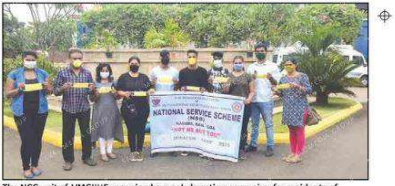
The NSS unit of VMSIIHE organised a mask donation campaign for residents of Manora, Raia.

The students spoke to the locals about their worries and educated about the importance of wearing masks when they step out of the homes, proper washing of hands, social distancing and other measures.