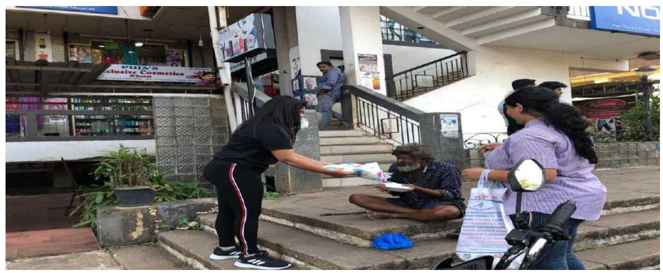
Students donating for Homeless People of Vasco : 04/12/2019

The NSS unit of V.M. Salgaocar Institute of International Hospitality Education conducted a donation drive along with NGO "The Healers" for homeless people in Vasco on 4<sup>th</sup> December 2019. Prior to the drive, staff and students deposited blankets, bedsheets, towels, woollen caps, old clothes, socks, backpacks, cloth bags and mats in the collection box in the campus. Students along with some staff walked through the streets of Vasco city distributing biryani packets and clothes etc. to the homeless people. They got to interact with many people and it was an enriching experience to see the smiles and gratitude that they exhibited.