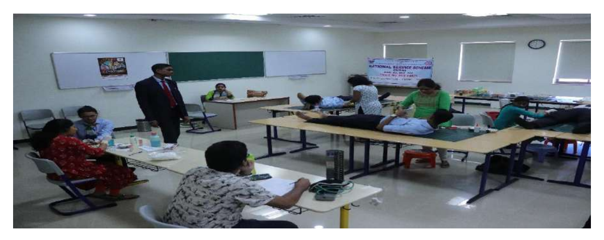
Blood Donation Camp: 11/03/2020