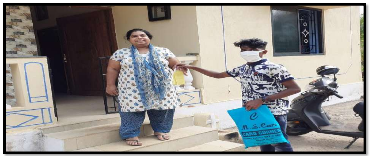
Mask Donation Campaign: 15/05/2020

On 15th May 2020, the NSS Unit of VMSIIHE organised a Mask Donation Campaign for residents of Manora, Raia. The students distributed 250 masks to approximately 60 houses surrounding the college in an attempt to help locals adapt to the current challenges of the COVID 19 pandemic. They spoke to the locals about the importance of wearing masks when they go out, proper washing of hands, social distancing etc. The locals appreciated and were very pleased with the bold gesture that the students did during these challenging times.