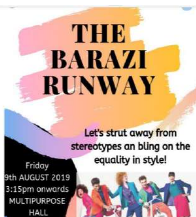
BEST COSTUME-ONLY WOMEN DO ALL THE SHOPPING